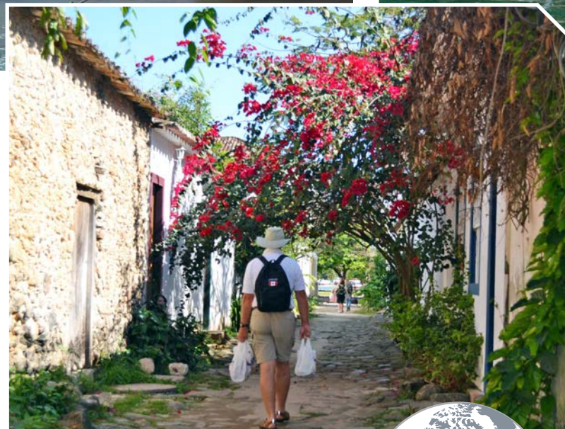
Clockwise from top left: When it comes to partying, Brazilians mean business; you don't have to travel far, though, to escape the crowds; the author and his wife at the start of their journey north; the author on his way back from a local market

Angra dos Reis is located along Brazil's Costa Verde just south of Rio, and the surrounding bay is dotted with more than 360 islands. Ilha Grande, the biggest of these, is trimmed with pristine beaches and has emerald green tropical forests and paths leading to the mountainous interior. There are no vehicles on this 20-mile-long island, only a footpath that circumnavigates the perimeter. What continues to amaze me is that in all my years of pouring through endless subscriptions of sailing magazines, there is no mention of this jewel of a cruising ground.